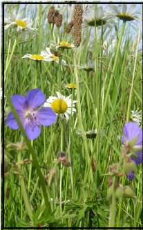
Fertile Soil mixture

Small wild flower seeds should be sown straight onto the surface of the soil or compost and left uncovered. Larger seeds should be covered with a light layer of compost or soil.