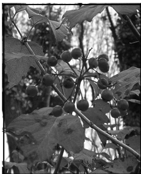
Guelder Rose Berries